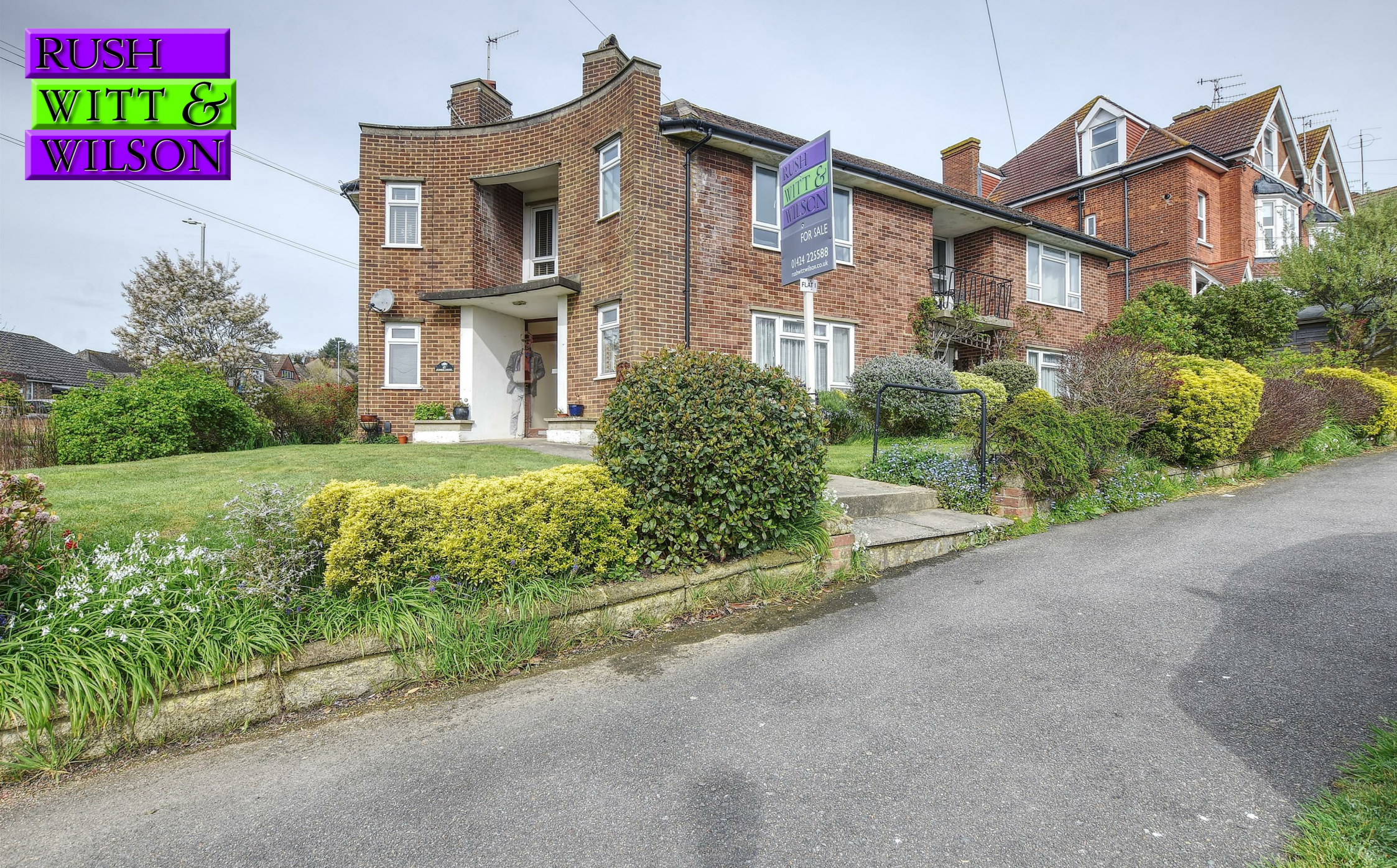
Flat 2, Sussex Court, 45 Manor Road, Bexhill-On-Sea, East Sussex TN40 1SN £225,000